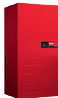
E.g. heat pump Hoval Belaria® Compact IR