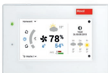
Touch display TopTronic® E