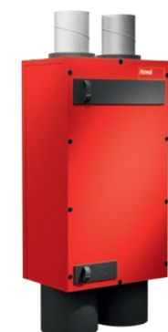
Comfort ventilation Hoval HomeVent®